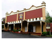
A & I Hall, Bangalow

The historic A & I Hall, Bangalow is the ideal venue for events of all kinds (weddings, conferences and performances)