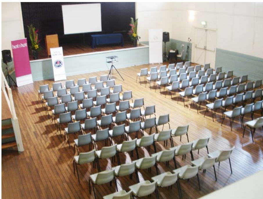
Set up for recent conference (150 pax)

The Hall can accommodate approx 320 as a seated audience in the main hall.